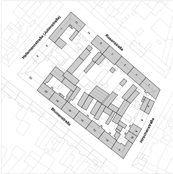
Block 1 - 1850