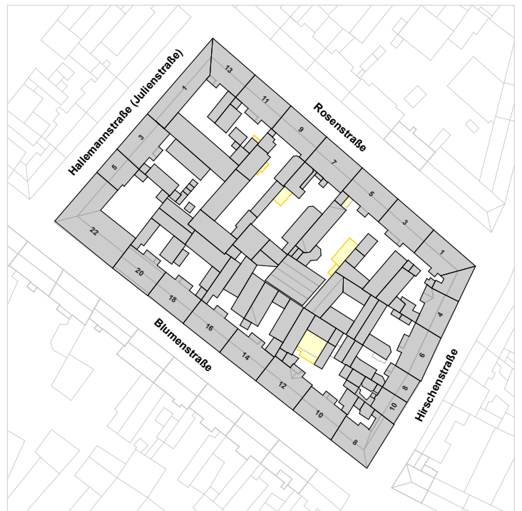
Block 1 - 2021