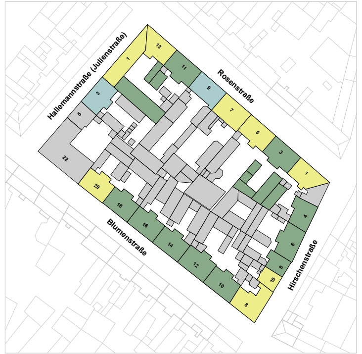
Block 1 - 1891