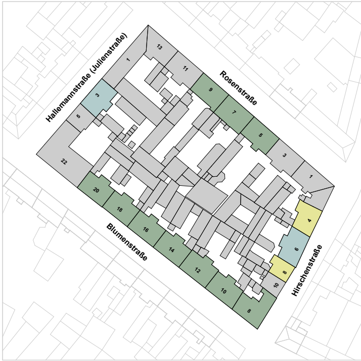
Block 1 - 1880