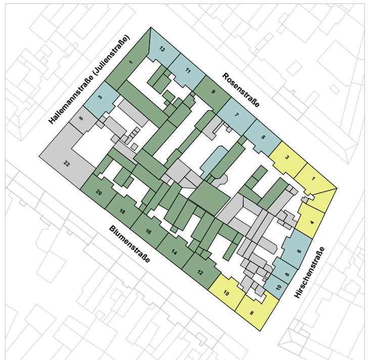
Block 1 - 1931